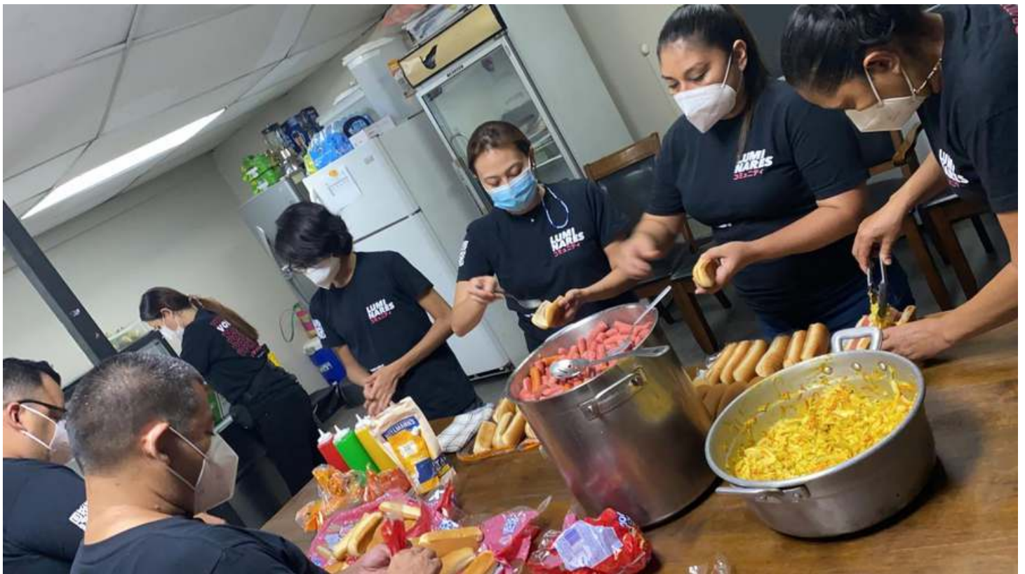
We are so grateful for our volunteers! A local church donated food, and spent an evening preparing meals and distributing them with us as part of our Thursday night outreach!