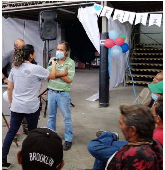
Right: We had a wonderful time celebrating Father's Day in the Lighthouse Resource Center this month and honoring the fathers in our program.